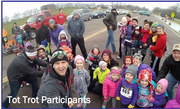
Tot Trot Participants

Thank you so much for supporting IRIS at the 8th Annual IRIS Turkey Trot. We had over 1500 paid Participants with over 2000 participating.