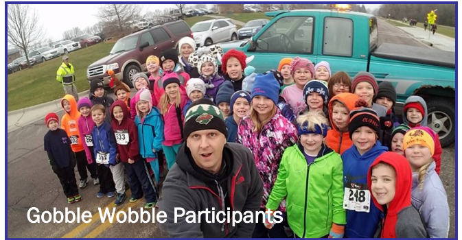
Gobble Wobble Participants