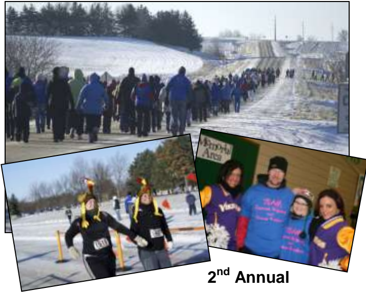
2 nd Annual